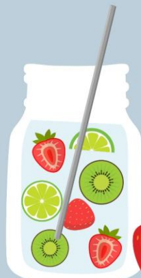
STRAWBERRY + KIWI + LIME