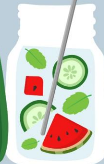
WATERMELON + CUCUMBER + MINT